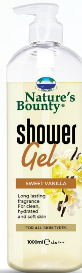
SWEET VANILLA 400ml | 1000ml