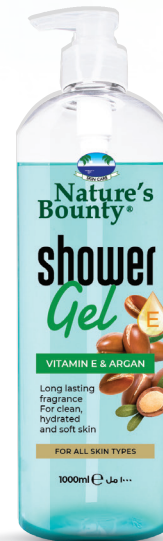
VITAMIN E & ARGAN 400ml | 1000ml