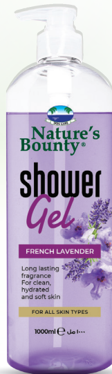
FRENCH LAVENDER 400ml | 1000ml

Long lasting fragrance For clean, hydrated and soft skin