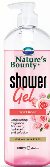
SOFT ROSE 400ml | 1000ml