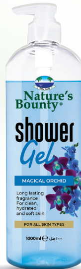
MAGICAL ORCHID 400ml | 1000ml