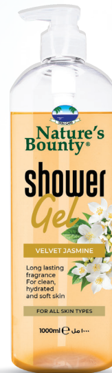
VELVET JASMINE 400ml | 1000ml